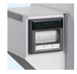
Recorder / Printer for data collection