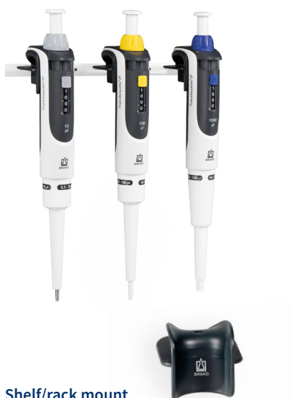
Shelf/rack mount for 1 Transferpette® S single- or multi-channel pipette.

With holders and stands, the devices are always properly stored and close at hand for the next application.