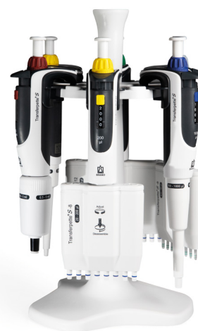
Bench top rack for 6 Transferpette® S single- or multi-channel pipettes.