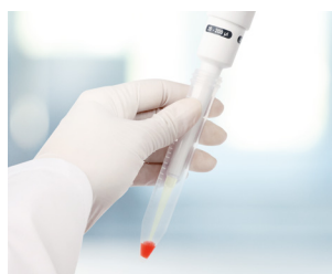
Narrow centrifuge tubes