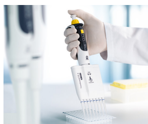
Working with PCR plates