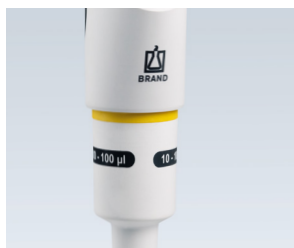
Integrated shaft coupling