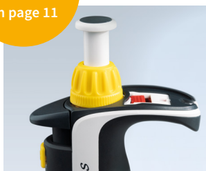
Easy Calibration technology