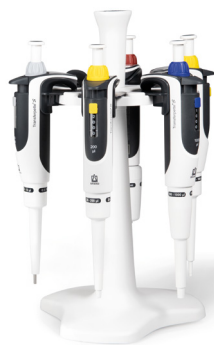
Pipette Package 2