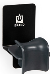
Wall mount for 1 Transferpette® S single- or multi-channel pipette.